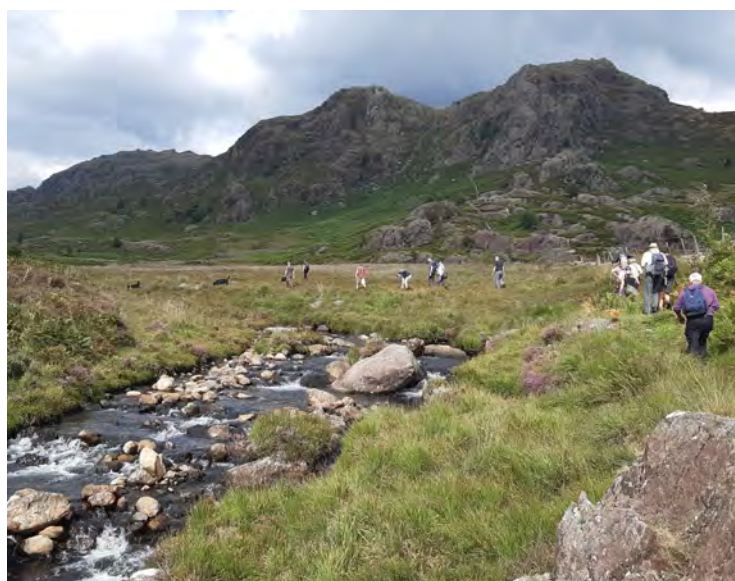
The Guided walk took us alongside Tarn Beck