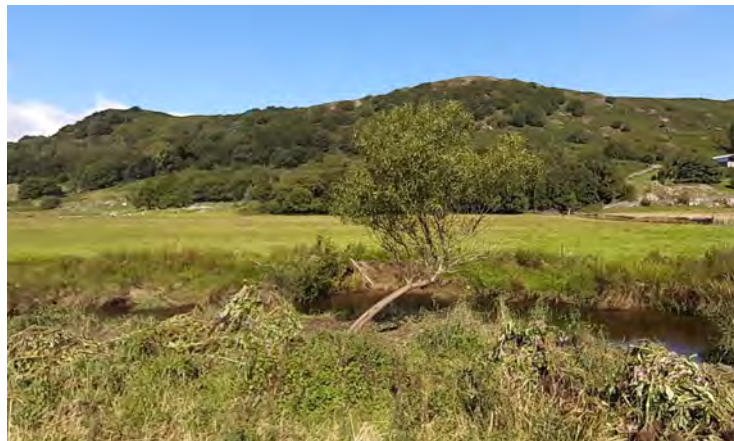
AFTER: piles of defeated balsam!