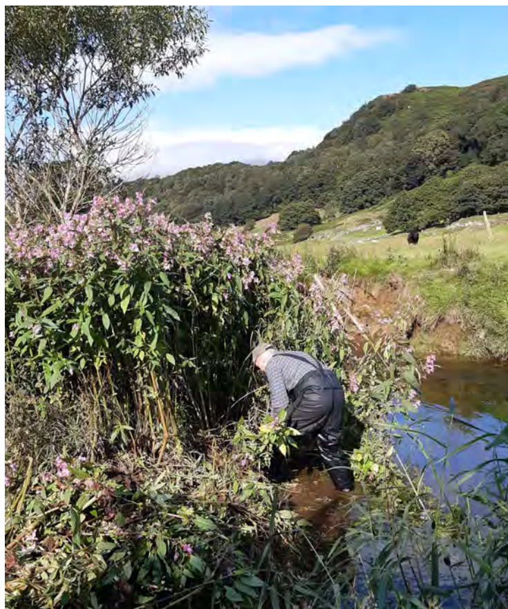
Getting stuck in on the River Lickle

Pulling balsam is a good physical work out in the fresh air and therapeutic, leaving a sense of satisfaction and achievement - why not give it a go next year?!