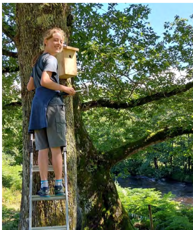
A volunteer puts up a nest box next to the River Duddon.

In summary, it is all a bit of a mad rush. After all, the next generation of these charming birds could depend on it.