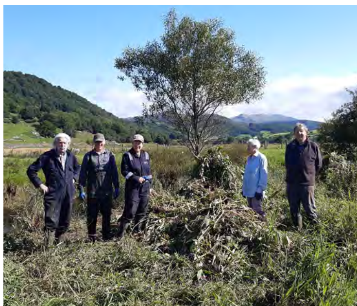
Balsam bashing volunteers admire their handiwork!

The priority for next year must be to get more volunteer hours in June and July to minimise seed production and reduce the work load in 2025. We