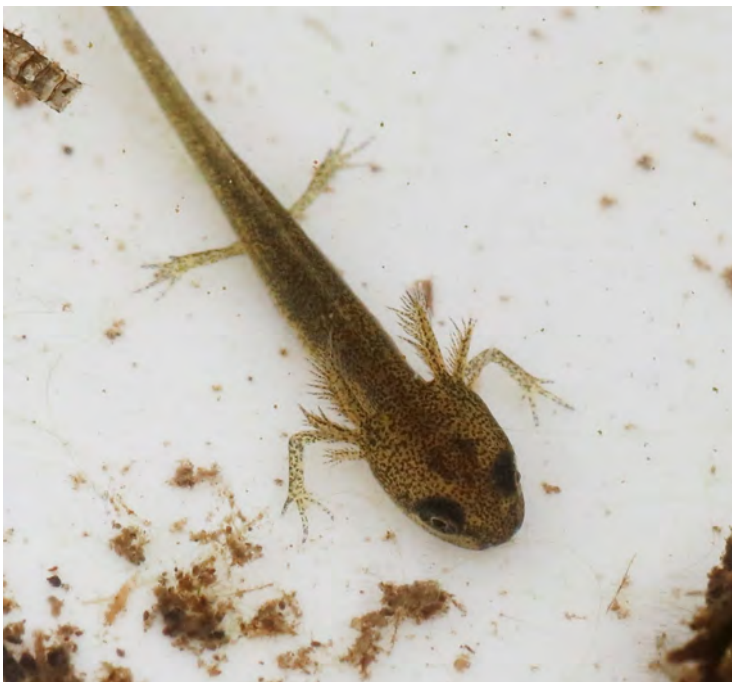
Larval newt: a pond-dipping find at Tomsteads

We also arrange occasional guided walks during the summer where local experts help us identify and learn more about various species and projects. Examples