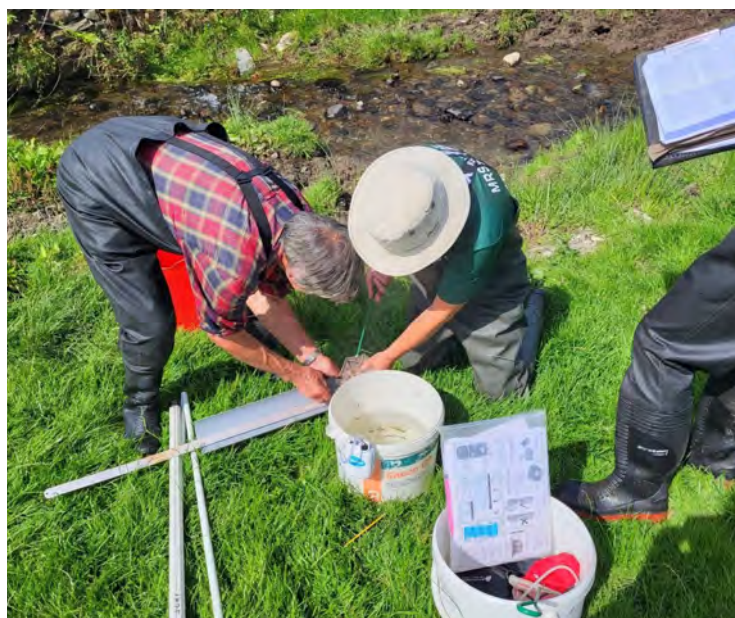
Above & right: Volunteers participate in electrofishing surveys.

The remaining three sites surveyed were on Tarn Beck,