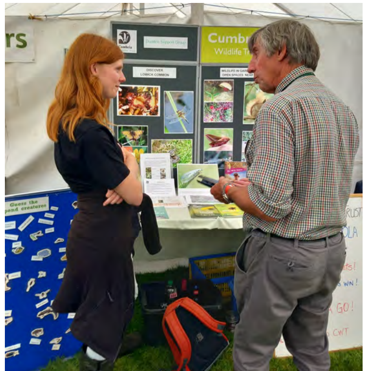
Duddon LSG display at Millom and Broughton show

include, natterjack toad walk (Haverigg), Birds and Breakfast walk (Broughton), a mushroom foray , a visit to the Restoring Hardknott Forest project, walks on the Monk Coniston estate, Lowick Common and South Walney reserves. Walks are free of charge but donations are welcome.