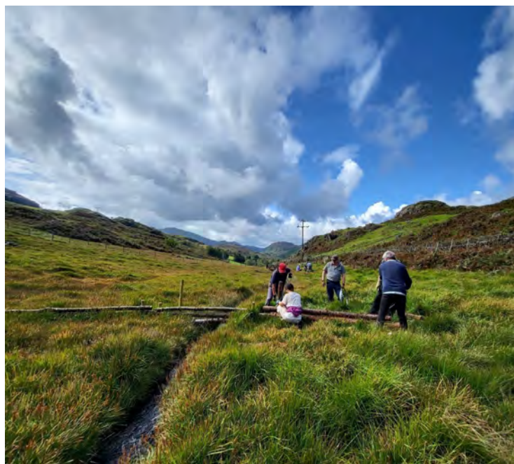
Volunteers build a leaky dam extension

Due to the flashy nature of the beck, it was decided that even more water storage could be encouraged, so each dam was expanded with additional wing walls. Two new leaky dams were also installed in between some of the existing dams to again enhance their effect.