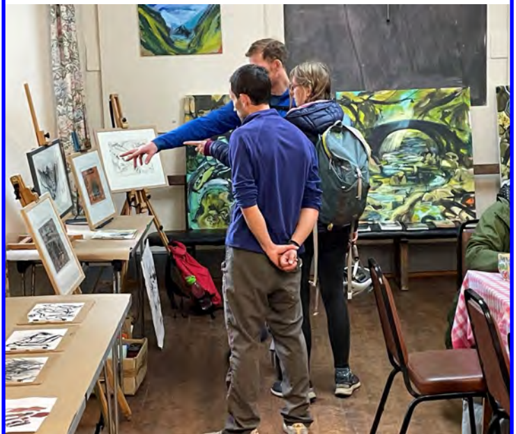
The exhibition at Seathwaite Parish Room

Landscape is very important to many of us as a 'sense of place', and staff at the Friends of the Lake District (FLD) are very aware of this. One of the recent FLD 'Landscape Grants' was awarded to Seymour Fine Art and Cole's Gallery, and funded a painting trip that followed the River Duddon from source to sea. We thought this may be of interest to our DRA members.