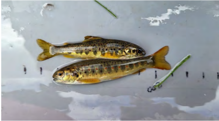
Salmon fry and trout fry caught on Old Park Beck

Old Park Beck and Moasdale. The lowest number of fish caught were at Tarn Beck (9 fish caught) and Moasdale (8 fish caught) - this compares to the highest number of 63 caught on Old Park Beck. This is likely to have been impacted by high flow levels as both surveys were completed after heavy rain. Again, no Salmon were found. Trout Fry and Parr levels were fair and very poor at both sites.