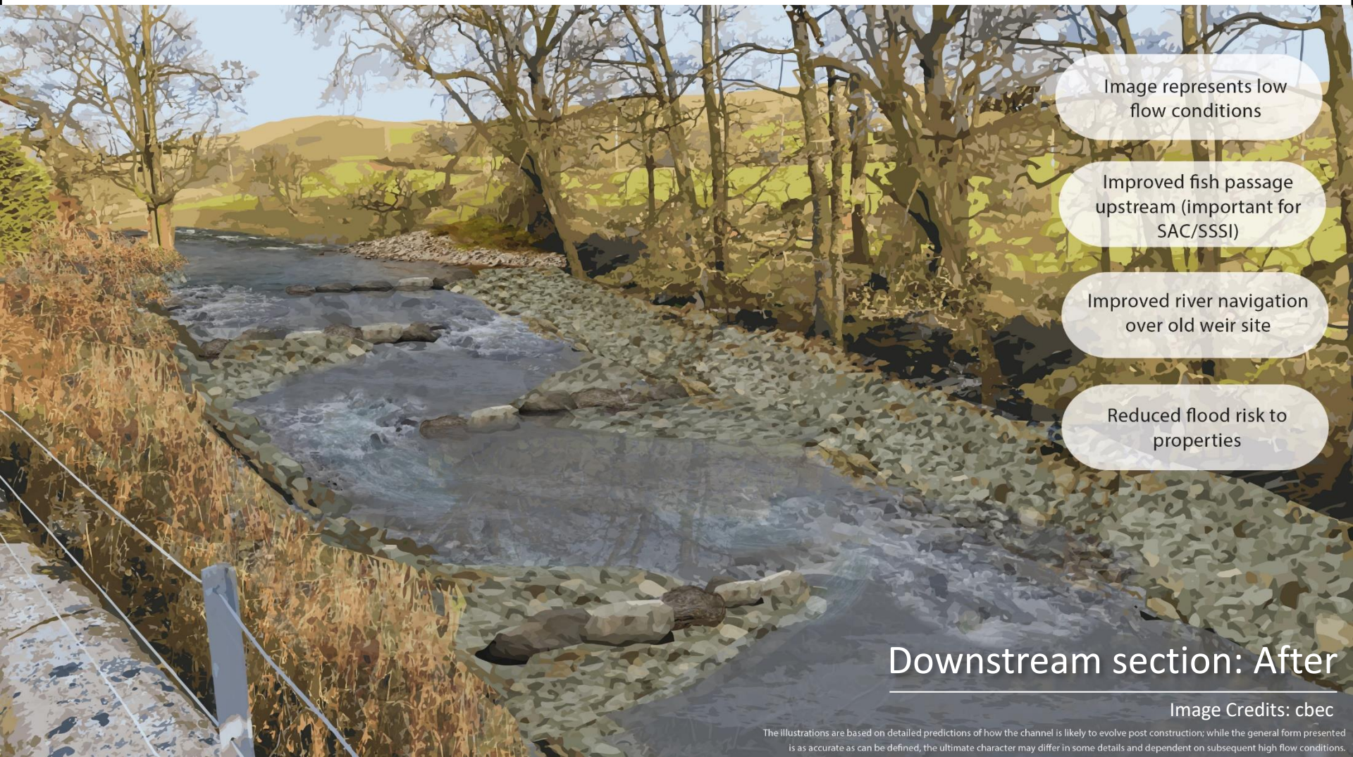
Image represents low flow conditions

Improved fish passage upstream (important for SAC/SSSI)